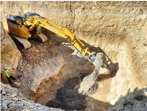
2024-06-06 Wet Well Foundation Flex Base Installation