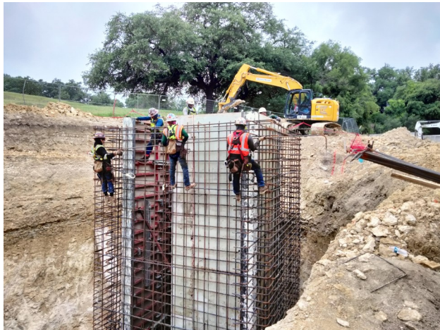
2024-06-12 Wet Well Walls Rebar Installation